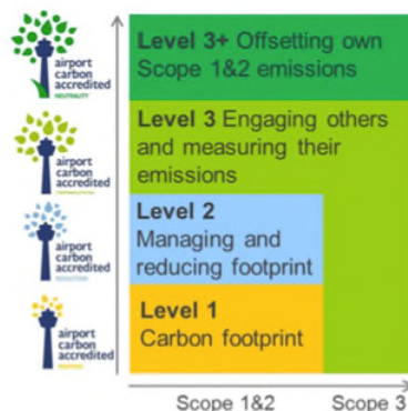
Figure 2: Main Requirements of Airport Carbon Accreditation

Accredited airports receive a certificate indicating the level they have achieved. The main requirements at each level of accreditation are presented below and in Figure 3.