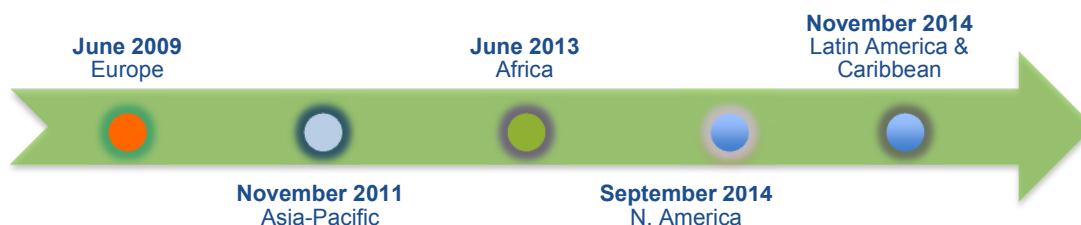
Figure 1: Airport Carbon Accreditation Milestones

The aim of Airport Carbon Accreditation is to encourage and enable airports to implement best practices in carbon management, with the ultimate objective of becoming carbon neutral. Accreditation provides the opportunity for airports to gain public recognition for their achievements, promotes efficiency improvements, encourages knowledge transfer, raises an airport's profile & credibility, encourages standardisation, and increases awareness and specialisation.